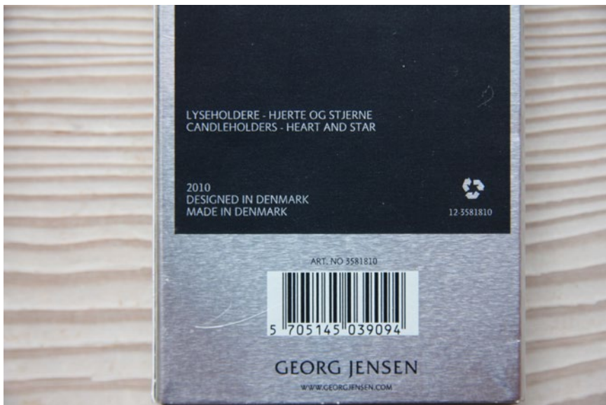
Figure 9.3 Packaging for Georg Jensen candle holders, 2010.

In the post-industrialist economy most design companies have seen it as economically sound, or even a condition for survival in a global market, to move production to so-called 'low-cost countries'. And the development is not restricted to Denmark and Danish design. In Britain, for example, the Burberry brand – despite its heavy brand reliance on 'Britishness' and its appointments by royal warrant to the Queen and the Prince of Wales – has been closing down factories in Wales and Yorkshire and has moved much of its textile manufacturing to China (Gould 2009). The reliance of Italian manufacturers on Chinese (legal and illegal) immigrant workers in the production of designs that are 'Made in Italy' has become widespread. An example is the production of traditional fine fabrics in Tuscany: commentators have remarked on the 'non-Italian' nationality of labourers making these goods (Donadio 2010).