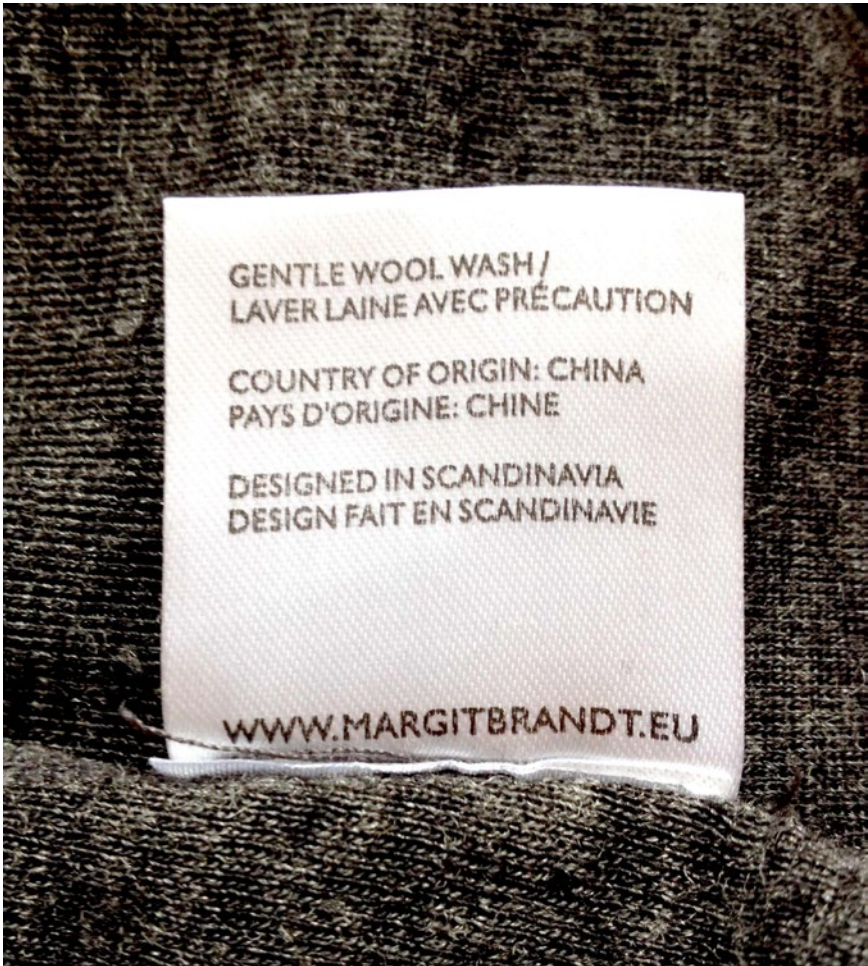
Figure 9.5 Label in tunic by Danish fashion brand Margit Brandt, 2013. The brand existed in the 1960s and 1970s and was relaunched in 2005.

no nation at all, the European Union. In this matter of origins the European Commission appears to have underestimated the strength of the link between design and nation and the value of design for the national identity of European countries. Likewise, design historians may have been seduced by the rhetoric of globalization and have thus overlooked the continuing importance of the nation-state with its laws, its export policies and its promotional practices.