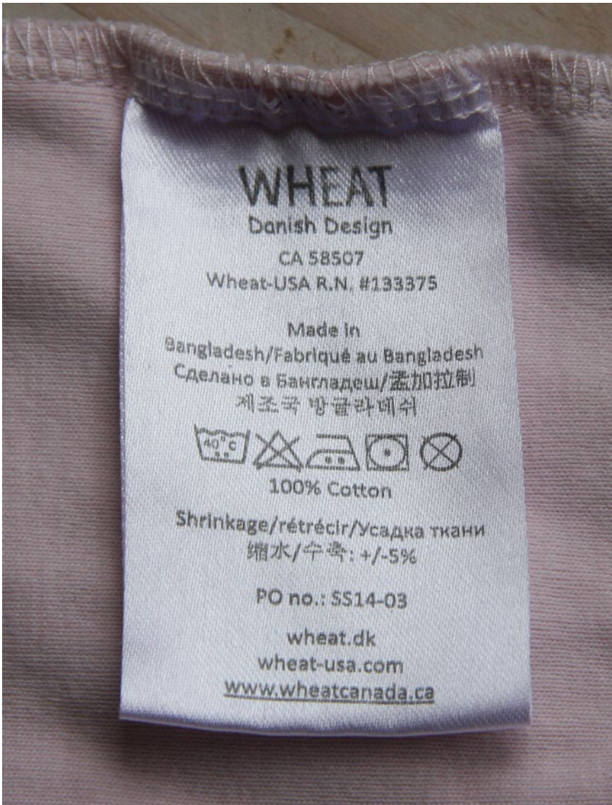
Figure 9.1 Label in shirt by Danish children's clothes brand 'Wheat' (2014).

the 'Designed in ...' labels constitute a new and ingenious way of linking designs with nations.