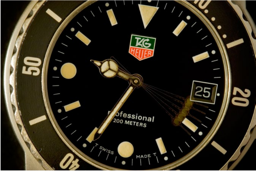
Figure 9.2 Photo depicting ‘Swiss Made’ print on TAG Heuer watch.

For example, in Switzerland, the predicate ‘Swiss Made’ on watches is governed by strict national rules (‘232.119 Verordnung vom 23. Dezember 1971 über die Benützung des Schweizer Namens für Uhren’, retrieved 30 March 2014 from http://www.admin.ch/opc/de/classified-compilation/19710361/index.html ). The phrase ‘Swiss Made’ seems to be the first such national designation, arising, in English, in response to the Centennial Exposition in Philadelphia of 1876, at which there seemed no way to distinguish American products from others (Wälti 2007). Thus, reflexively, again, it was reception in a foreign country, or the need for clarification in exports, that motivated a legal enactment of national branding. That it was in response to the Centennial Exposition helps to explain why a nation with four official languages should use a fifth language, English, to brand its products. There is a further aspect of specific interest to design historians: the phrase was not to be hidden on the back where such labels usually belong but was incorporated into the face as an element of the design. The phrase selected was ‘Swiss Made’ rather than ‘Made in Switzerland’ because the nine letters plus one space could be disposed symmetrically around the numeral 6, and thus they remain as a constant element in Swiss design.