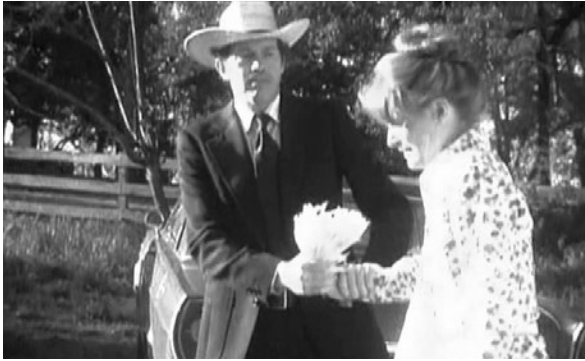
Figure 4.3 A sentimental education: Cockfighter (New World Pictures)

requires us to think of nature not as in the abstract, but rather as something which is only visible and meaningful in particular manifestations.