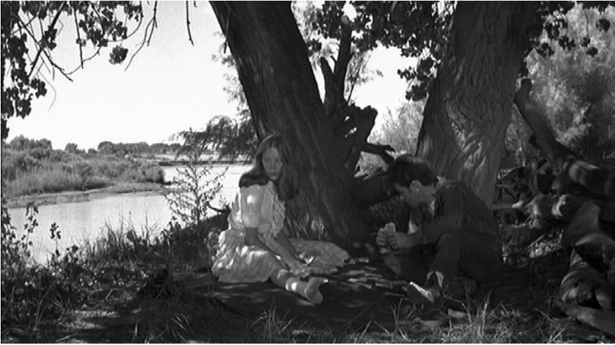
Figure 0.3 ‘The tree makes it nice’: Badlands (Warner Bros.)

purposes of a romantic scene. The players have become too aware of their surroundings, too self-conscious of the ways in which their story will intertwine with those surroundings.