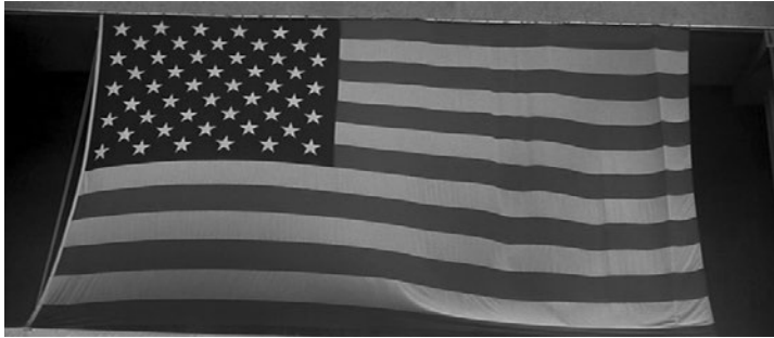
Figure 2.1 The flag as thing: Nashville (ABC / Paramount Pictures)

gathering is a mirroring, or channelling, of the US nation. This may be so, but it would be a mistake to turn away from the flag and towards the characters too hastily, as Nashville is as complicated and ambiguous in its deployment of this as it is in casting the fates of its ensemble.