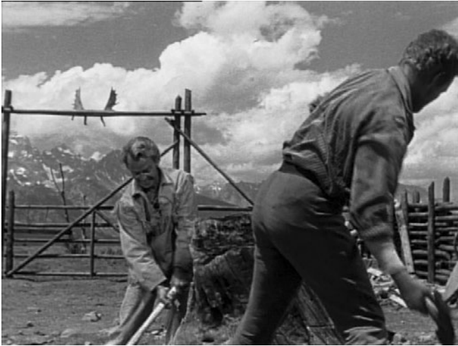
Figure 3.1 Symbolically conquering the environment: Shane (Paramount Pictures)

and vital importance for the various homesteaders, these are not the grounds on which Joe convinces them to stay. For the homesteaders, for Shane , and to no small extent for the western as a genre, the land generates its importance from what it stands for and is meaningful to the extent that it can be overcome. As is exemplified in the stump-chopping episode, this overcoming is in play, but rarely in doubt.