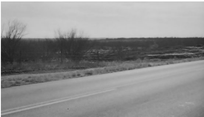
Figure 5.1 A telling location: The Last Picture Show (Columbia Pictures / BBS Productions)

Architecture, much lighter in South. Gray, heavy and stony – much more massive and colder in the North. Maybe Lila and Walter should go North to South –