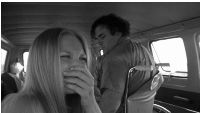
Figure 4.1 Revolting surroundings: The Texas Chain Saw Massacre (Vortex)

Central to this is the role of both oil and agriculture in the fate of the youngsters; it is their reliance on fuel, for example, which leaves them susceptible to the murderous family, and that family’s brutal techniques are explained as being the fruits of their agricultural training. The implications of this (which a number of other commentators have remarked on) will be discussed in slightly more detail below, when situating the film in more of an historical context. At this stage, it is useful to consider how the film’s drama is also dependent on quite basic, essential ‘qualities’ of Texas. The intense heat and bright sunlight, for