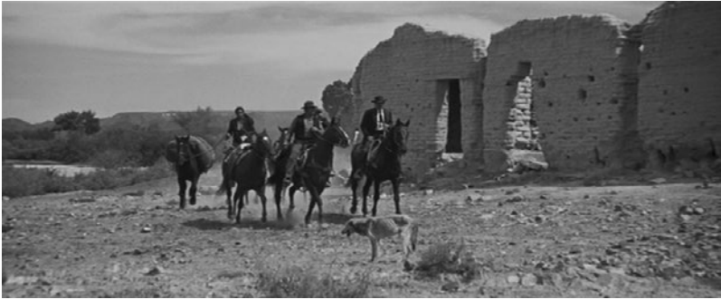
Figure 3.2 Indeterminate boundaries: The Wild Bunch (Warner Bros. / Seven Arts)