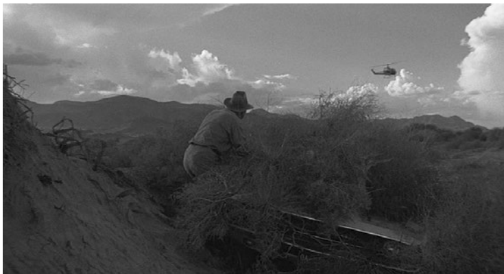
Figure 3.4 Rooting in: Vanishing Point (Cupid Productions / Twentieth Century-Fox)

The advice to 'root right in', to not leave one's situation, might initially seem to contradict the basic ethos of the fugitive film, but perhaps it reveals something more nuanced and brings us closer to what is interesting about this genre's value system from an ecocritical perspective. Contrary to first impressions, actual escape is not what is at stake in the fugitive film (Kowalski is at one point advised that he cannot 'beat the desert'), but rather the characters' methods of relating to an environment. According to the logic of the prospector, engaging more fully and more imaginatively with your current surroundings represents its own kind of rebellious independence. Bonnie and Clyde, Mary and Larry, Doc and Carol,