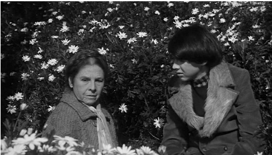
Figure 0.1 Falling in love: Harold and Maude (Paramount Pictures)

On what terms does Harold and Maude invite us to understand, enjoy and sympathize with the relationship of its central characters? Primarily, I would argue, it does so on environmental terms; but not in the sense that Ashby's film prioritizes an environmentalist 'message', regarding issues such as pollution, conservation or energy sustainability. I instead suggest that the non-human world becomes significant and meaningful not simply as a reflection of Harold and Maude, but as an independent context, and one which cannot be reduced to