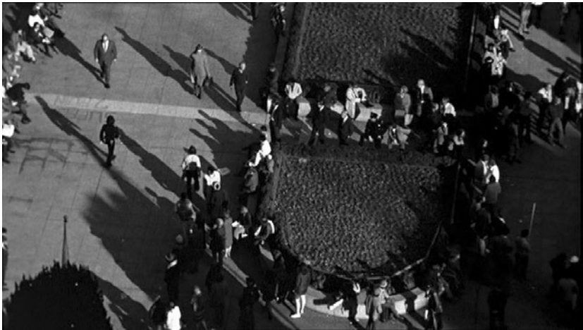
Figure 5.4 A zoom in search of an object: The Conversation (American Zoetrope / Paramount Pictures)

Jaws is a film whose very premise is bound up with filmmaking challenges: a huge shark; underwater point-of-view shots; night scenes on boats; numerous crowd scenes. As in the examples of Easy Rider and The Conversation , such practicalities at certain moments become meaningful constituents of the film's fictional fabric. This is especially the case in the first half of Jaws , when much of the drama is of a logistical nature (how can a busy beach be policed by a man unwilling to go in the water?), and Spielberg strives to establish the beach as a barrier whilst also allowing us privileged glimpses of the shark's movements. The most famous zoom in Jaws is almost certainly the track-zoom into the face of a panicked Chief Brody (Roy Scheider), repeating the technique Hitchcock used in Vertigo . It is an effective punctuation, and Spielberg has been given too little credit for his significant variation on Hitchcock's effect (the two moments achieve quite different results). However, there is another zoom which appears later in Jaws , and which is at once more conventional and more mysterious.