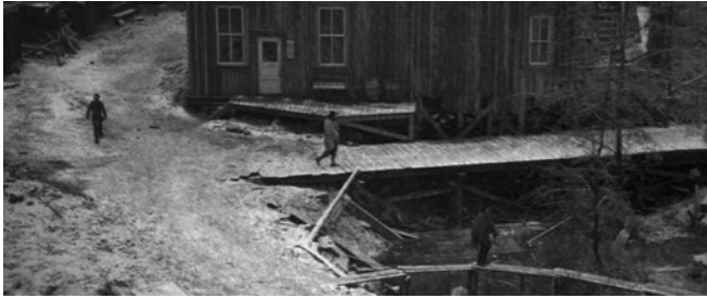
Figure 5.3 Hopeless orientation: McCabe & Mrs. Miller