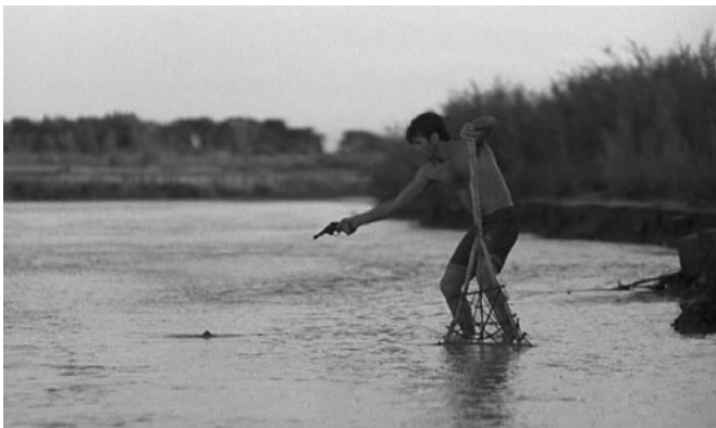
Figure 2.3 The 'real' Kit: Badlands (Warner Bros.)

It is dusk, and Kit is wading in the river, fishing. We have already seen him fail miserably at this, and he is failing again. In the far distance a white truck drives past, and Kit looks up to follow it. It is more than a glance – he stands erect in order to see the van properly – but it is difficult to ascertain whether he is looking nervously (Kit is wanted for murder) or longingly. After one final attempt to catch a fish he sheepishly brings out his gun; the film cuts briefly to a distant onlooker, back to Kit shooting, and finally once more to the onlooker, who hastily walks away, presumably to report what he has seen. Kit has already displayed his willingness and ability to adapt to the woodland environment in a number of ways, so what prompts him to turn to the gun? Did the passing van remind him of the impossibility of a new start in a new world? After all their effort, he and Holly are barely a stone's throw from the nearest main road. 'Let's not kid ourselves', he could be thinking, 'I might as well just shoot'. This is the first fateful decision made in the scene; the second is on the part of the onlooker, who does nothing until he sees Kit shoot, at which point he decides that this stranger is definitely to be dealt with. It is not clear whether this man knows anything about Kit (or that there is a