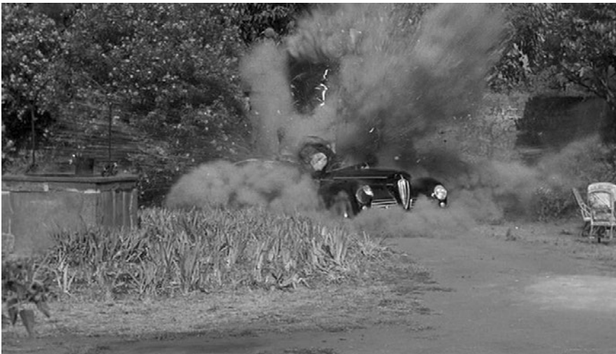
Figure 2.2 The machine in the garden: The Godfather (Paramount Pictures)