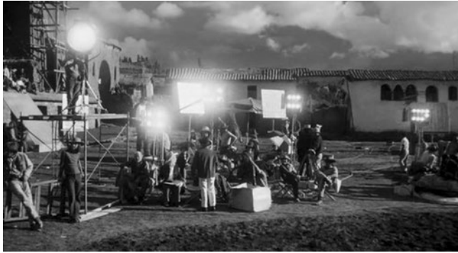
Figure 5.2 A film present in the world: The Last Movie (Alta-Light)

partly because the film's very narrative is propelled by the activity of location shooting, and partly because the ethics of location shooting are brought into question, and kept perpetually in play. Ara Osterweil has already written an excellent study of this film's geographical politics and philosophy (and even, as part of this, performs a regional reading of it); while I recognize the deep contradictions Osterweil identifies in Hopper's project, 'between movie-made fantasies of space and the real-world practices of place' (2011: 184), an ecocritical approach seems to reveal something a little different. What is striking in Hopper's film is not so much its political incoherence, and the galling chasm which separates its rhetoric from its production circumstances, but rather the way in which it is continually drawn to depictions of filmmaking as a fundamentally located, bodily activity. It seems wonderfully evocative of its time, not for its disillusioned commentary on countercultural ideals, but for its sense that Hollywood filmmaking has now to be imagined as a presence in some sort of territory.