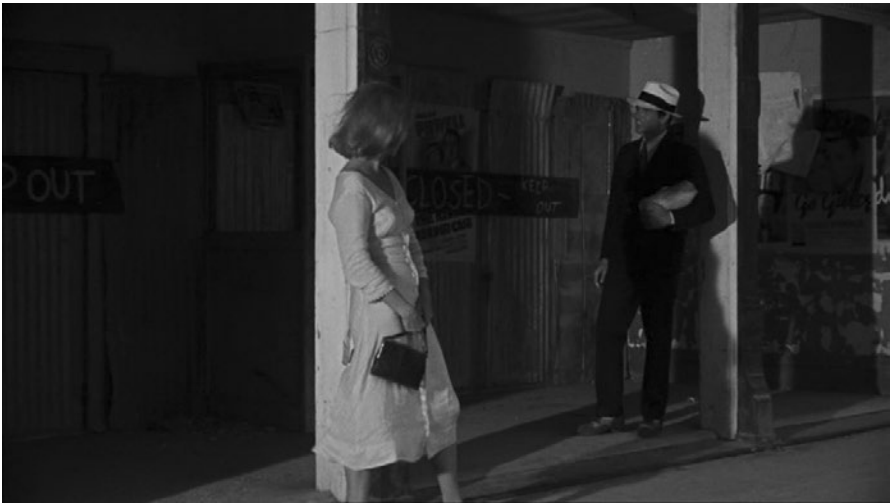
Figure 3.3 ‘A mobile organicity’: Bonnie and Clyde (Warner Bros. / Seven Arts)

which alternately follows a path and has followers, creates a mobile organicity in the environment’ (1984: 99). Walking emerges as an environmentally creative activity, even a statement: