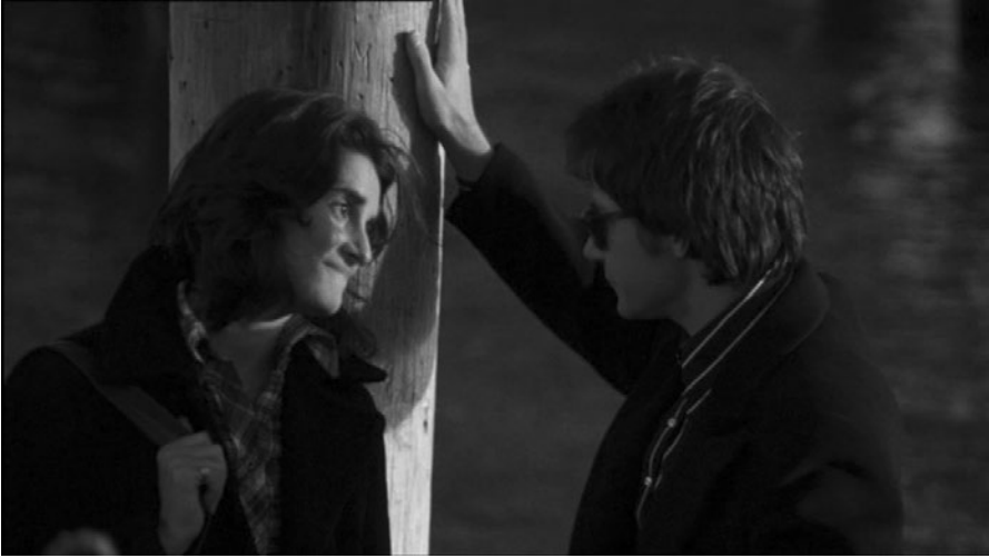
Figure 0.2 Resisting the setting: Mean Streets (Warner Bros.)