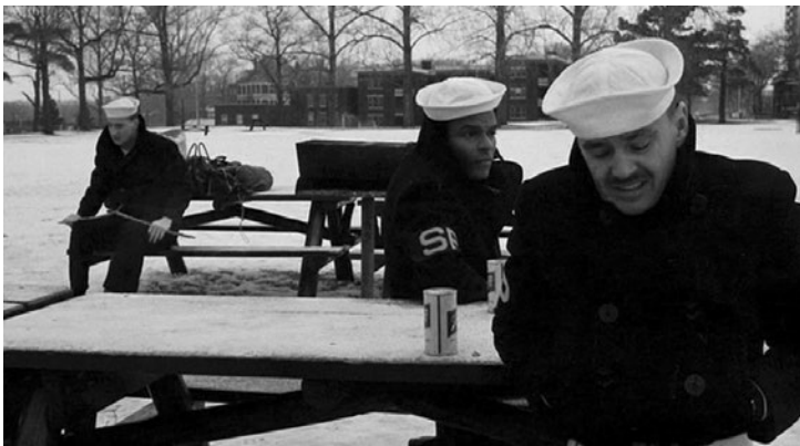
Figure 4.4 'He's come a long way': The Last Detail (Acrobat / Columbia Pictures)

In her 1974 Cannes Film Festival report for Sight and Sound , Penelope Houston suggested that The Last Detail 'knows exactly where it's at [...], preserving its sense of balance, scale and detail' (1974: 143). In a piece a few years later (quoted above), Roger Greenspun used a noticeably similar description in reference to The Texas Chain Saw Massacre , arguing that 'it almost always understands what it's looking at' (1977: 16). These reviews seem to be responding to quite allusive qualities of scale and scope that this chapter has interpreted ecocritically. The environmental sensibility of New Hollywood is a quality which is traceable not only to its films' presentation of spaces and places and materials, but also to the geographical range of its dramas. George Kouvaros's study of the films of John Cassavetes is called Where Does it Happen? (2004),